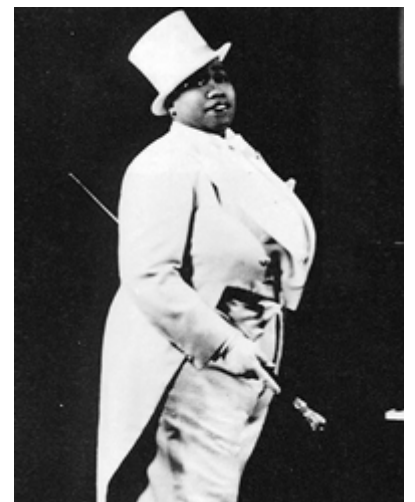
Gladys Bentley, American blues singer, early 1930s