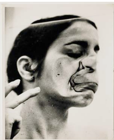
Ana Mendieta, "Untitled (Glass on Body Imprints)- Face", 1972.