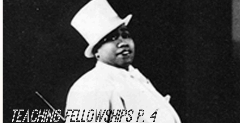
TEACHING FELLOWSHIPS P. 4